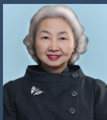
THE HONOURABLE MISS ELSIE LEUNG OI-SIE, GBM, JP

You would have seen depictions of court scenes and portrayals of famous lawyers in film, television and social media. Few things capture the imagination like the drama and suspense of a trial. This unique set of competitions provides the opportunity for students not just to observe, but to be part of a very realistic mock trial, with judges who are eminent members of the legal profession, and set in the impressive Moot Court at the Faculty of Law, University of Hong Kong. There is no lesson like hands-on experience, no excitement like the chance to have a say in how a trial unfolds. It would be a pity to pass on such a “one in a lifetime” event.